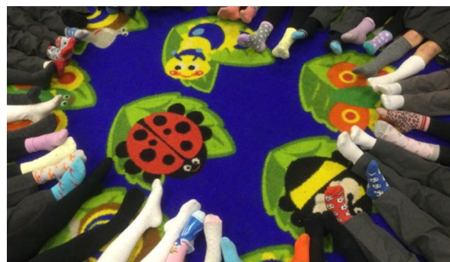
Odd socks campaign for anti-bullying day

Occasionally there are children and young people who need more wellbeing support than school staff can offer. In these cases, schools will support families with referrals to external agencies and Mental Health professionals for example Bereavement Counselling, Child and Adolescent Mental Health Services (CAMHS) and Music, Play or Art Therapists.