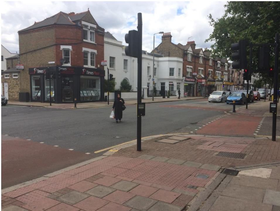
Figure 2A: the junction of Kimber Road, Swaffield Road and Garratt Lane

Despite having no immediate access via pedestrian crossing, the site has a good level of accessibility for pedestrians. There are dropped kerbs at crossing points to aid those with mobility issues, but there is no tactile information provided, which may limit accessibility for those with sensory impairments. There is a major signalised crossing about 200m to the north, where Kimber Road and Swaffield Road meet Garratt Lane. This is depicted in Figure 2A.