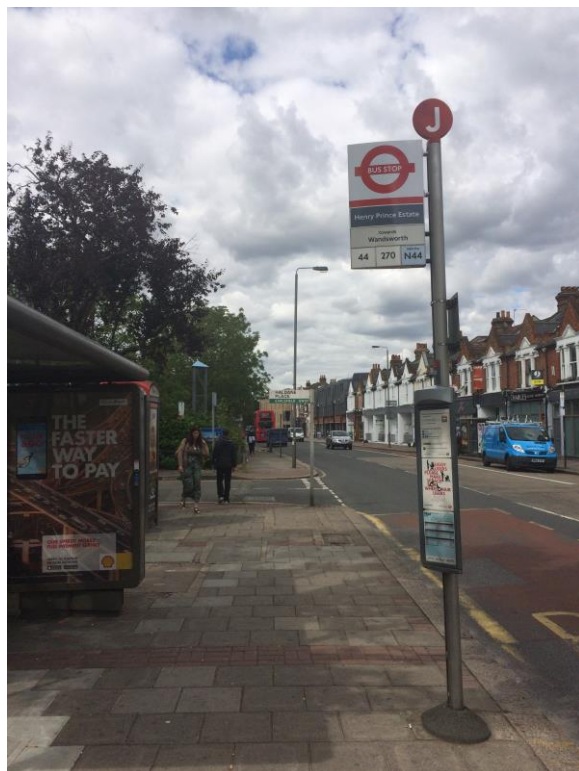
Figure 2B: Swaffield Road stop